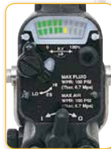
Smart Display Readout at the gun allows for quick indication of voltage and current