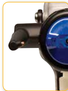
External Charging Probe Designed for quick release and easy cleaning