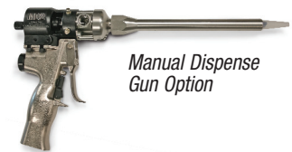
Manual Dispense Gun Option