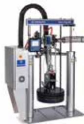
Therm-O-Flow® 200 Hot Melt System