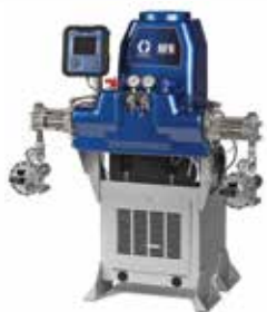
HFR Metering System