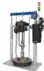
D200 Ambient Supply System