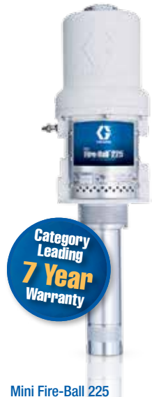
Mini Fire-Ball 225